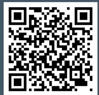
Fall Retreat QR

October 13h - Fall Retreat Registration Closes October 22nd - Passion Registration Opens (Jrs-College Students) October 27th-29th - Fall Retreat @ Logan Valley November 17th - Bonfire @ the Stokes November 22nd - No Youth Happy Thanksgiving! December 2nd - Paintball December 13th - Christmas Party White Elephant Exchange December 17th - Passion Deadline December 20th/27th - No Services (Christmas Break) January 3rd-5th - Passion Conference January 7th - Unite Registration Begins January 14th - Youth Evangelism Conference